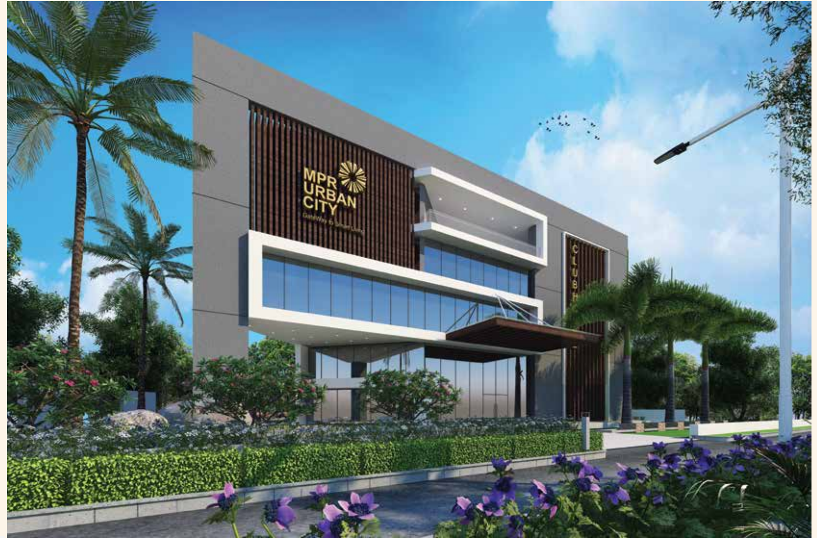
* an artistic impression of MPR Urban City clubhouse entrance view

Affordability designed around every comfort is the essence of MPR Urban city. The 16,000 sft Clubhouse offers you an enriching experience. Everything here is design to ease the stress of your busy lifestyle to make life's best experience.