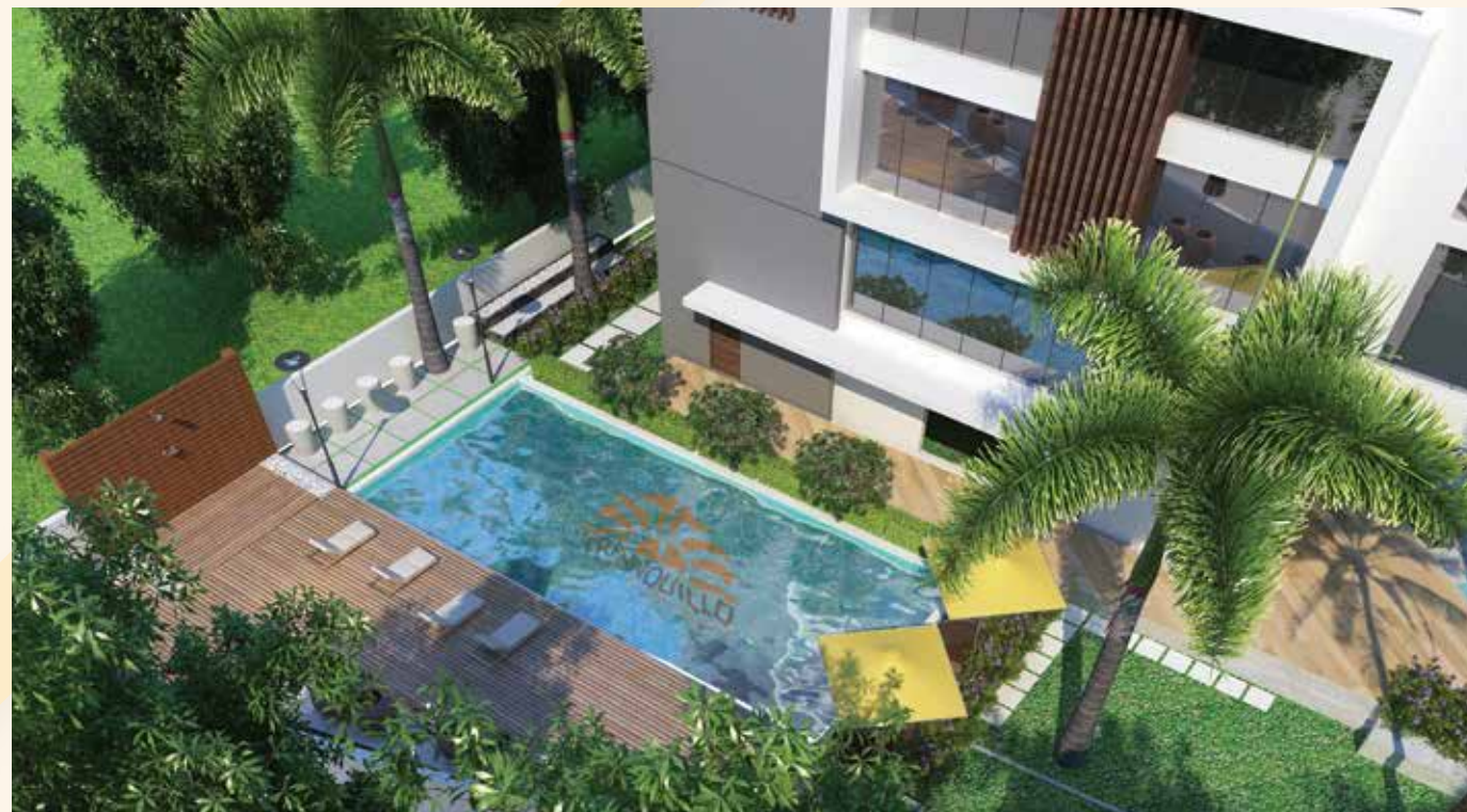
* an artistic impression of MPR Urban City clubhouse view