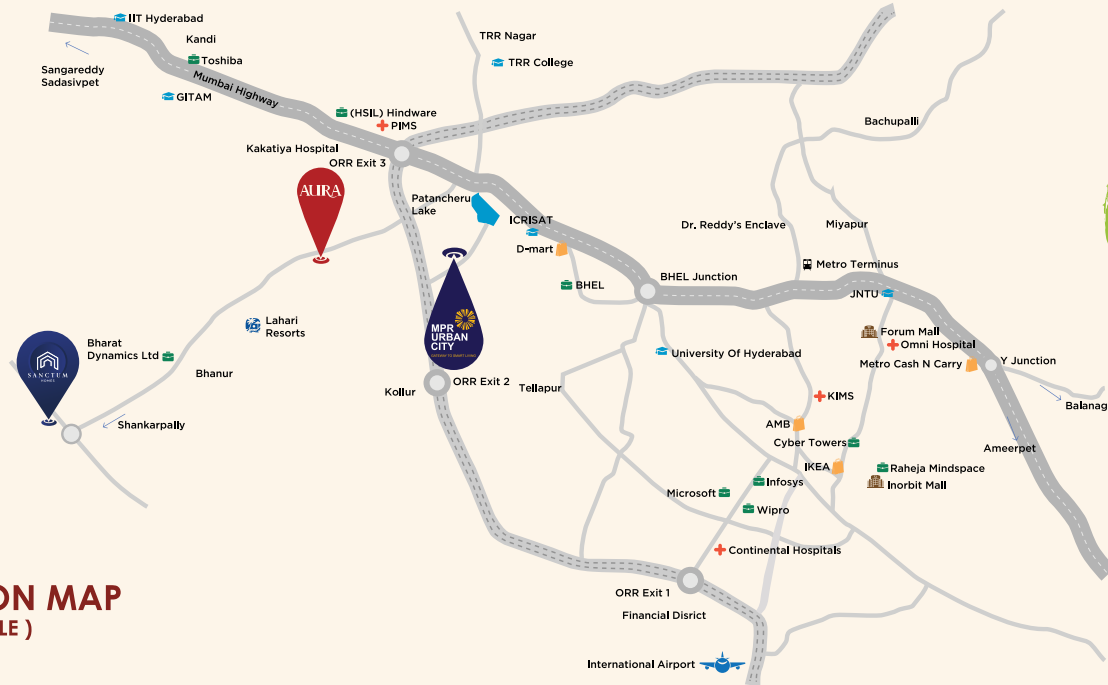
LOCATION MAP ( NOT TO SCALE )

The site of MPR Urban City offers a salubrious air together with a peaceful environment that's ideal for living a healthy and harmonious life. With the location advantage of closeness to the Financial district and IT Corridor. Enlivened by the best of urban facilities essential for living a comfortable life.