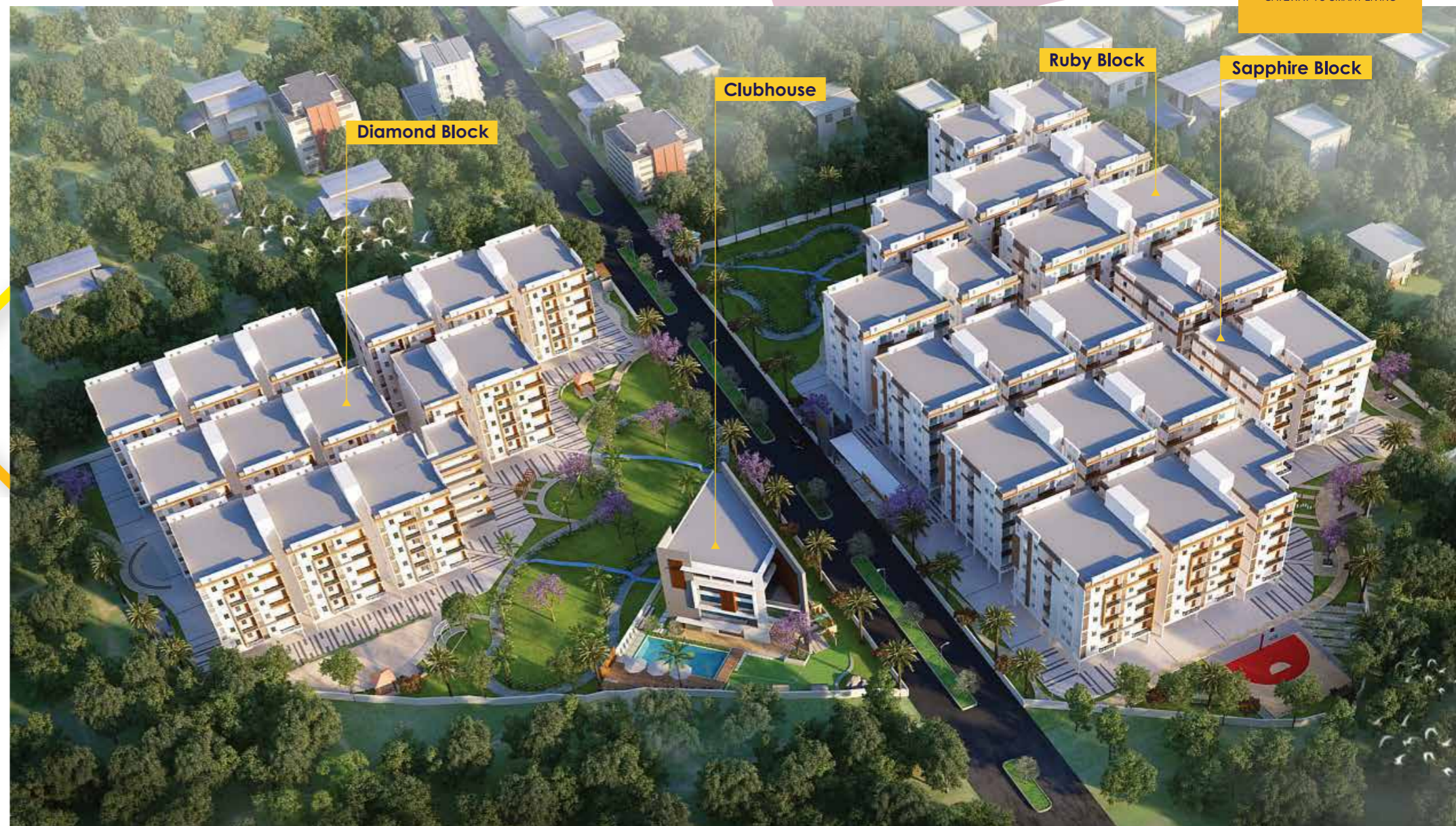
* an artistic impression of MPR Urban City aerial view